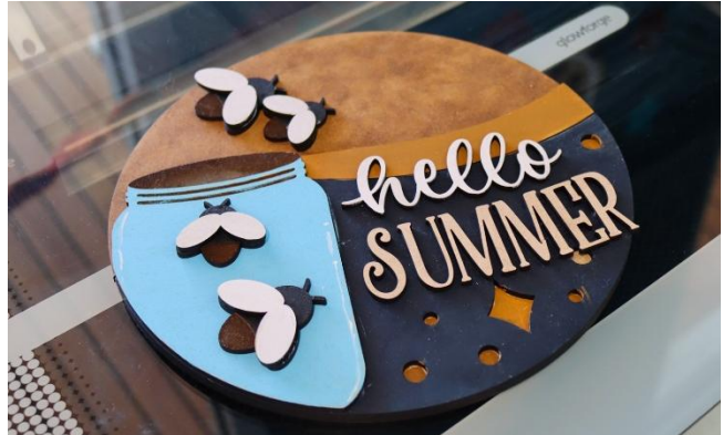
June's Glowforge Project

Attendees made a “Hello Summer” home décor sign (see right image). Staff added a second session due to high demand.