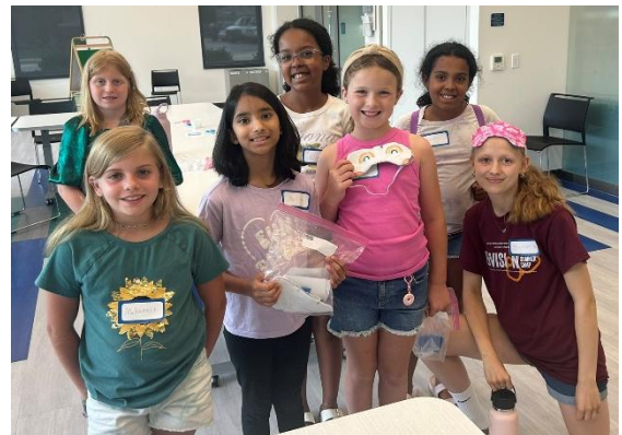
Sleep mask sewists gathered for a photo after a session of learning and making!

Elementary students learned how to hand-sew a sleep mask using two different types of stitches. (See right image.)