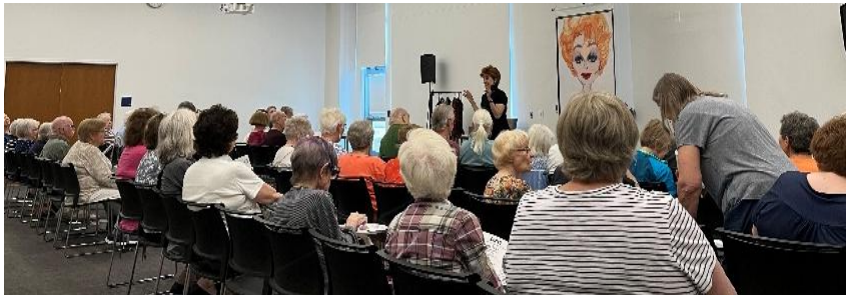
Patrons attending the Senior Social: Lucy!