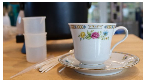
A floral teacup with candle making supplies.

Crafters made a candle in a vintage teacup. (See right image.)