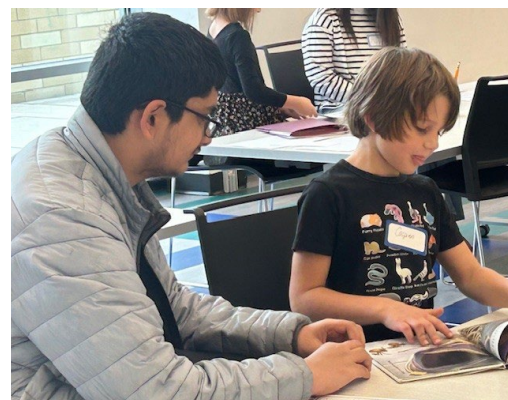
Book buddies reading.

After completing training, teen volunteers were partnered with early readers to practice their reading skills. (See right image.) We look forward to offering this new literacy building experience again in the spring.