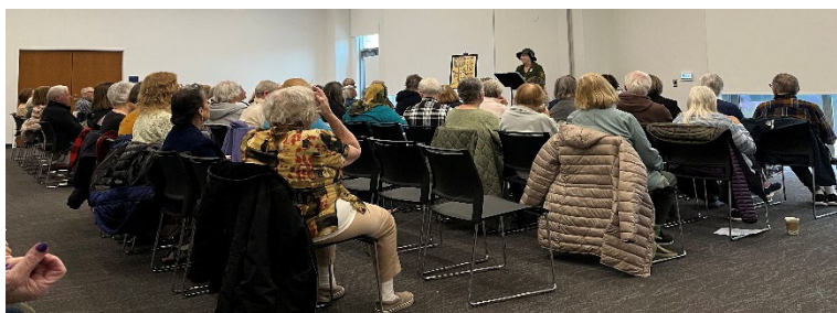
Patrons enjoy the November Senior Social on nurses during the Vietnam War.