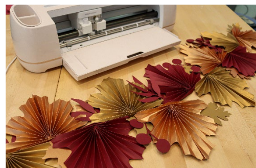
Red and gold paper table runner.

This month's Cricut program made a seasonal paper table runner. (See right image.)