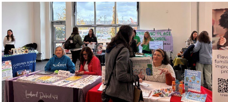
Participants connecting with local Early Childhood Organizations at the Preschool Fair .

Staff created an informational booklet that families can access through our website: Preschool Resources Booklet . A post-event survey was sent to all participants, with overwhelmingly positive feedback. All participants indicated that they are eager to attend next year and were pleased with the Preschool Resources Booklet.