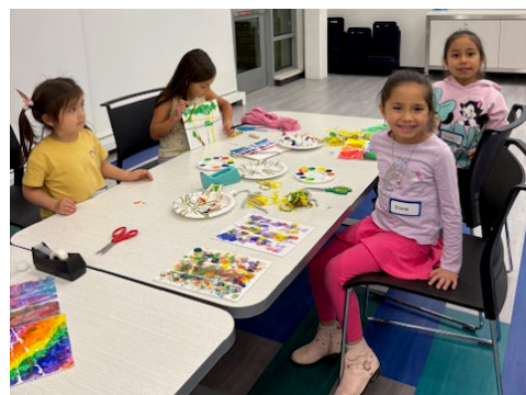
Participants enjoying Wrapped Yarn Painting .

Students made impressionist birch tree forest paintings using yarn, canvas, paint, and cotton balls. (See right image.)