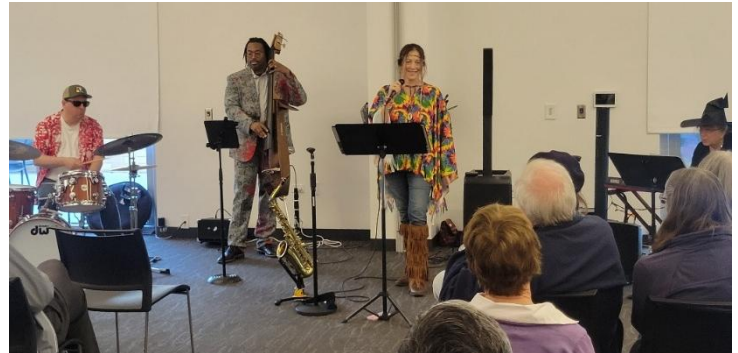
Zazz Jazz performs (in costume!)

Zazz Jazz entertained patrons with some spooky tunes (see right image).