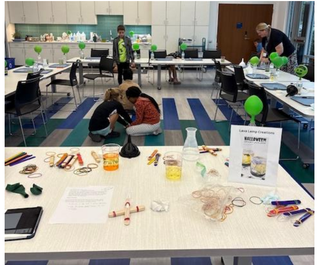
Students growing monsters at the Halloween Science program.

Elementary school students played “Frankenstein” and grew three different monsters, experimenting with acid-based reactions, density, solubility, and chemical reactions (see right image). The students then learned about energy and launched “eyeballs” with catapults.