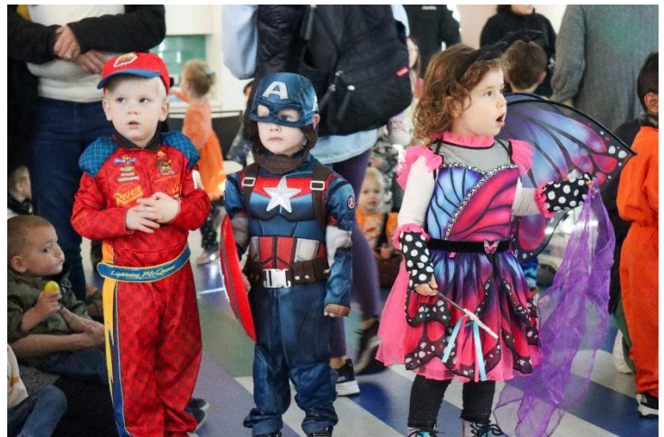
Kids enjoying the Monster Mash .

Staff welcomed 179 patrons dressed in their best costumes to the 1-hour drop-in dance party for Halloween (see right image).