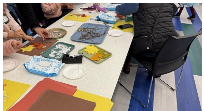
Patrons create stick figures with natural supplies during Nature Art.

Early learners used natural materials in unconventional ways and created several crafts (see right image). During the two registered sessions, participants made stick figure masterpieces (with real sticks) and sun catchers with leaves.