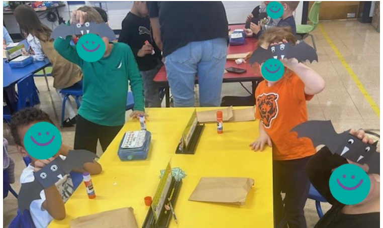
Kindergarten students at Madison Elementary School and their spooky bat crafts.

This October's story and craft kicked off the second year of quarterly Youth Services staff visits to kindergarten classrooms. Students listened, learned, danced, and made an extremely spooky bat craft (see above right image).